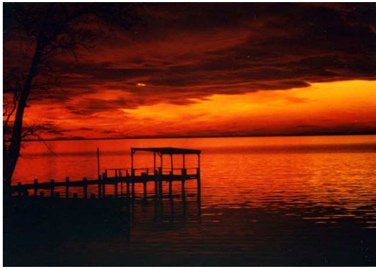
Sunset, Chesapeake Bay