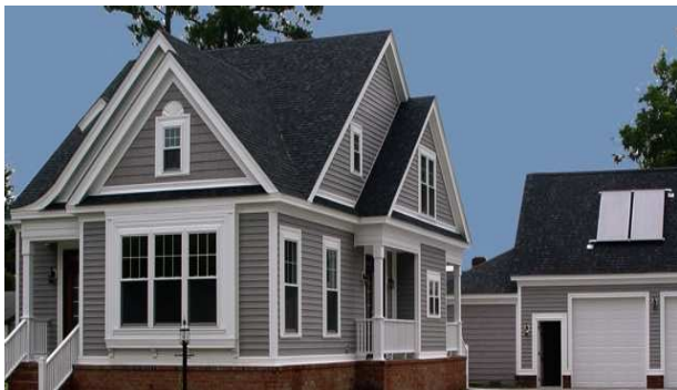
New Home in Raleigh, NC, with SolarH 2 Ot Collectors.

Integrated System: Your SolarH 2 Ot system comes with the main components already assembled. This reduces the time, complexity and cost of installation when compared with many other alternatives.