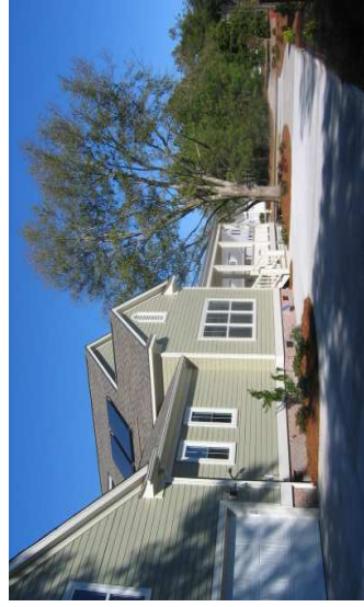
New Home in Wilmington, NC, with SolarHot Collectors.

Please give us a call. In just a few minutes we can answer your questions and connect you to a local Solar Builder or installer , offering you, the customer, a cost effective alternative to high energy prices.