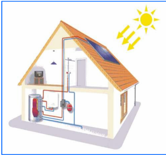
Graphic courtesy of ESTIF

rooftop solar collectors are hot enough to heat the water in your hot water tank.